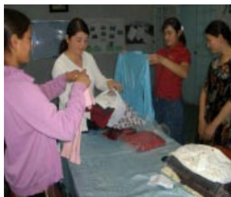
Kanibadam ILC students pack donated clothes for children from orphanage

The Tajikistan Global Connections and Exchange Program for Central Asia is a project of Relief International - Schools Online's Global Citizenship & Youth Philanthropy Program and has been made possible with major funding from the United States State Department Bureau of Educational and Cultural Affairs, the William and Flora Hewlett Foundation, and the Global Catalyst Foundation