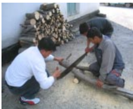
Gulyakandoz students help to cut firewood for people suffering from eye diseases

April was an especially exciting month for ILC project group and club students as this month's activity was devoted to Global Youth Service Day (GYSD). Throughout the month, students had the opportunity not only to learn about volunteering, but also to become real volunteers themselves and ready to do what they could to help members of their communities. Though GYSD was appointed for April 21 st – 23 rd , students decided to carry out several projects during the whole month of April, with the number of students involved in the community service activities sometimes reaching up to 100.