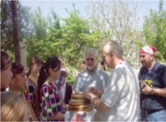
U.S. Exchange Teachers are welcomed by traditional bread and salt