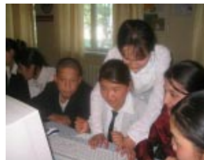
Kyrgyz students learn the first steps of computer technologies with the help of Chkalovsk peers

For about two months, the Internet Learning Center of Chkalovsk have been hosting schoolchildren from Batken and Ovchi-Kalacha, boundary regions of Kyrgyzstan. Every Tuesday students from the neighboring country visit our ILC in order to learn basic computer and Internet skills. To help Kyrgyz students to achieve this goal, project group students from Chkalovsk ILC conduct weekly trainings for them with great pleasure in spite of language difficulties. The language of communication between Kyrgyz and Tajik students is Uzbek, as some of the project group students can speak the language which makes their job easier.