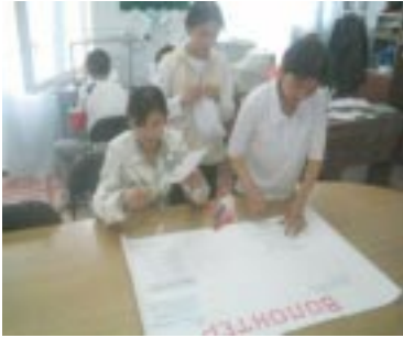
Creating wall newspaper about GYSD and volunteering

This month in celebration of Global Youth Service Day (GYSD) our Youth Leadership Clubs (YLCs) carried out very useful activities with great responsibility and enthusiasm. One of the main goals of the YLCs was to do as much community service as they could and with involvement of other community members. But before the start of GYSD events, young leaders conducted presentations at their ILCs and created very informative wall newspapers telling their community members and students from other schools about GYSD, its history, volunteering and volunteers, and how they can help their community. Students also talked about upcoming activities that YLCs and project groups planned to conduct for GYSD.