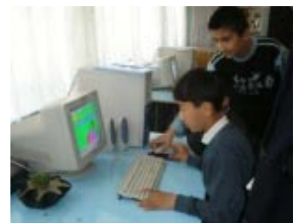
YLC member teaching young guests of Kayrakkum ILC to draw graphic images

Other YLCs visited disabled people and people living in elderly houses. Some students invited orphans and children from poor families to their ILC to show them what an Internet Learning Center is, teach them basic computer skills, and just spend a good time together by playing different interactive games. At the end of the meeting young leaders presented their guests with some gifts which were collected by project group students. Last but not certainly not least, were the activities carried out by YLCs with support from Small Grants provided by the RI-SOL head office. These grants gave financial support to those who were willing to help their community but needed funding to implement their great ideas. Sarband School No. 1, Vakhdat