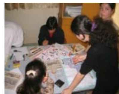
Students from Chkalovsk ILC create games for kindergarten children

Students believe that this activity helped them to understand the importance of volunteering and work in a community. We look forward to more community service projects from GCE students!