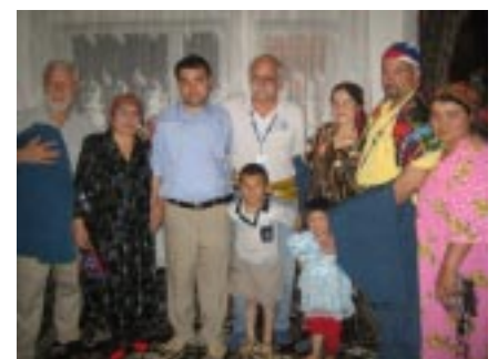
Home stay with welcoming Tajik family

Unfortunately, the teachers' stay in Tajikistan had to come to a close and thus everybody – Tajikistan students and teachers, RI-SOL Tajikistan staff and especially the U.S. teachers themselves were very sad but also happily gathered together on their last day on May 1 st , spent at the School for the Deaf.