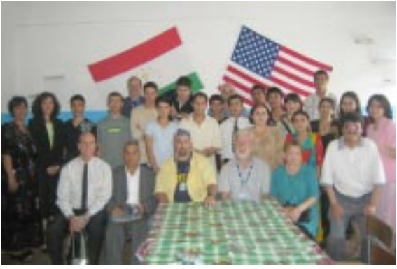
Exchange Teachers, Embassy guests, and teachers and students at the School for the Deaf