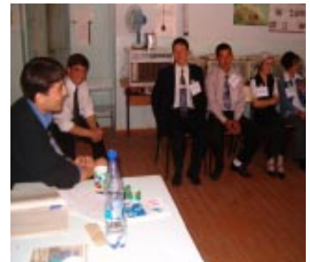
Psychologists answer students' questions on conflict and other issues

Communication with psychologists plays an important role in the life of teenagers. Given that not every school has its own school psychologist who could help students during difficult times, psychologists' advices and answers is extremely important in helping a teenager understand oneself and its surrounding society.