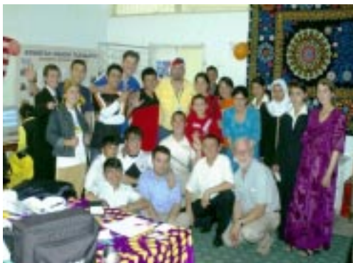
Isfara ILC and future 2006-2007 FLEX students with the U.S. Exchange Teachers