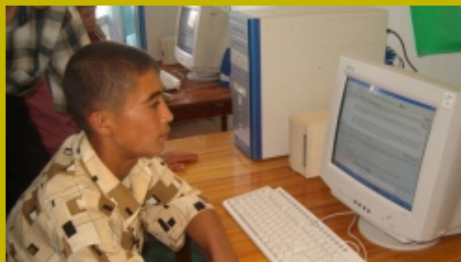
Participating in English Camp online forum. English Camp, School #1, Isfara

Relief International - Schools Online 18 Pavlov Street, Dushanbe, Tajikistan 734003 Tel: (992372) 21-06-55, Fax: (992372) 24-08-33 taj_office@schoolsonline.org , http://www.connect-tajikistan.org