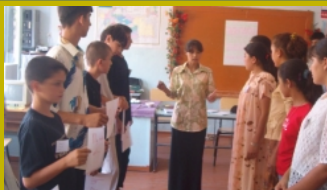
Playing 'Topic Cards' game during the English Camp. Gissar, School #2