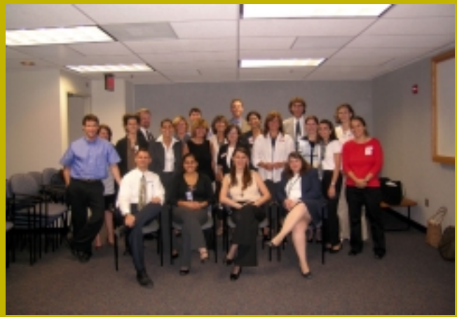
Participants of Connectivity Conference in Washington, DC

All the participants left the conference with a renewed sense of the importance for the Connectivity Program. As separate countries we know that the work we do is important for that country, but when we view Connectivity as part of a larger movement that will bring youth from all parts of the world together, we know that we are truly helping to make the world a better place.