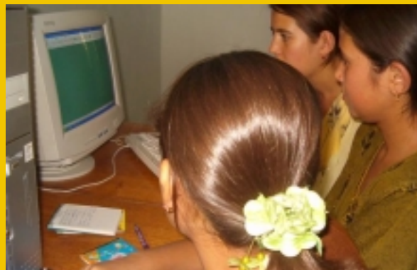
Connectivity Students discussing Internet issues during the forum. Isfara, School #1

For more information about this forum, please, visit: http://www.iearn.uz/iearn/forum/index.php?showtopic=238&st=0