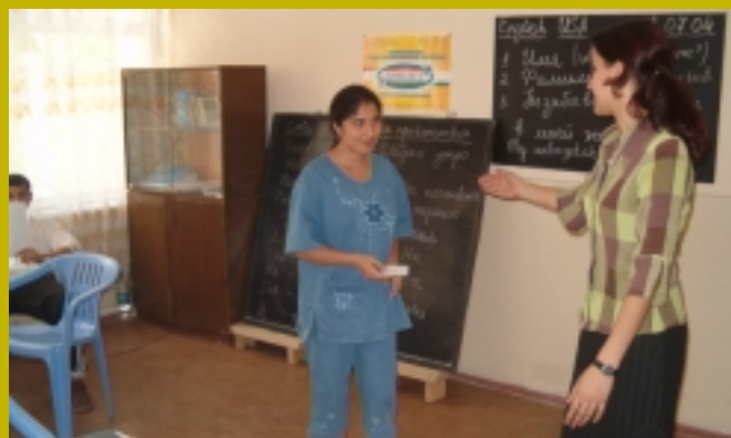
Introduce yourself game. English Camp, School #101, Tursunzade