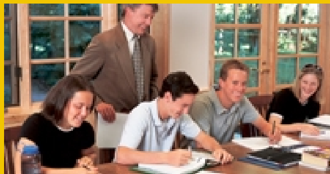
Colorado Academy, Denver Colorado. http://www.coloradoacademy.org/aboutca/overview/images/image01.jpg