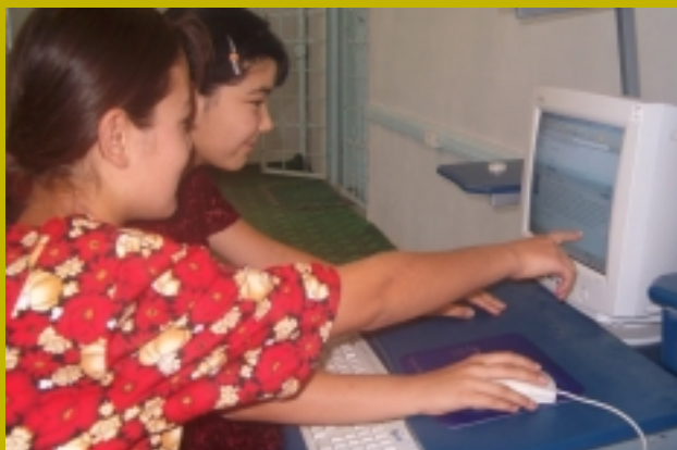
Kanibadam students working under "Travelling the World" activity, English Camp, School #3